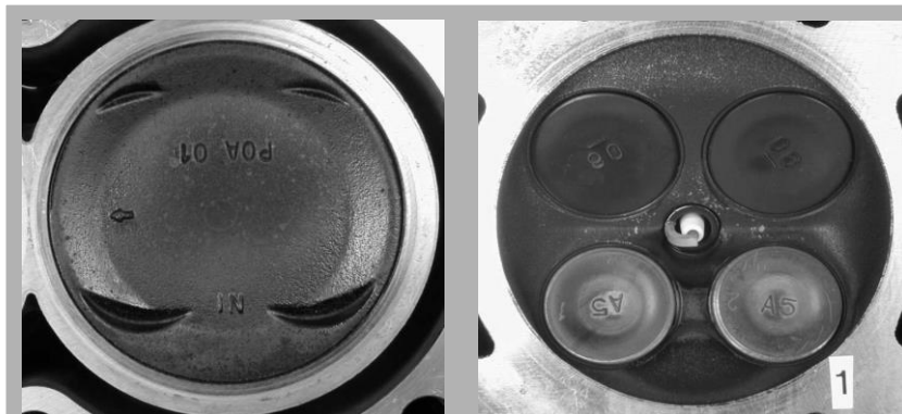
Honda piston and cylinder head upon completion of JASO CCD test with Cen-Pe-Co Gas-O-Klenz's detergent technology.

Cen-Pe-Co Gas-O-Klenz removes combustion chamber deposits, allowing the engine to operate more efficiently for better fuel economy.